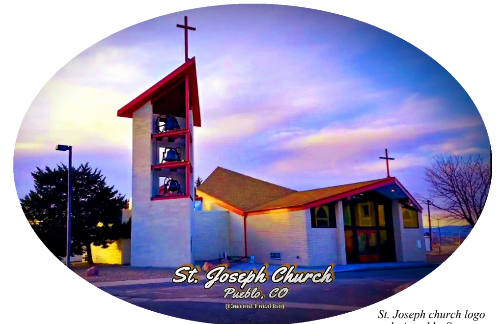
St. Joseph Church Pueblo, CO (Current Location)