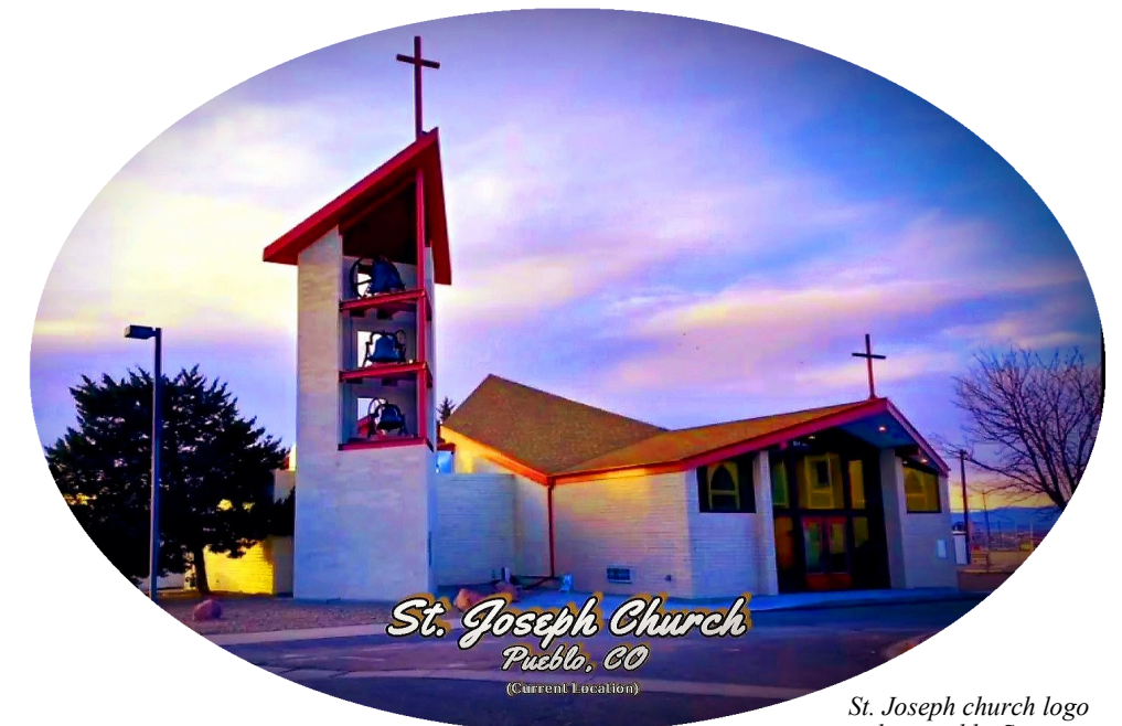
St. Joseph Church Pueblo, CO (Current Location)