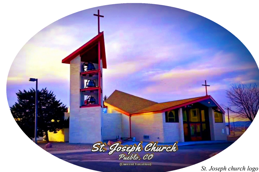
St. Joseph church logo designed by Sonny Gonzales